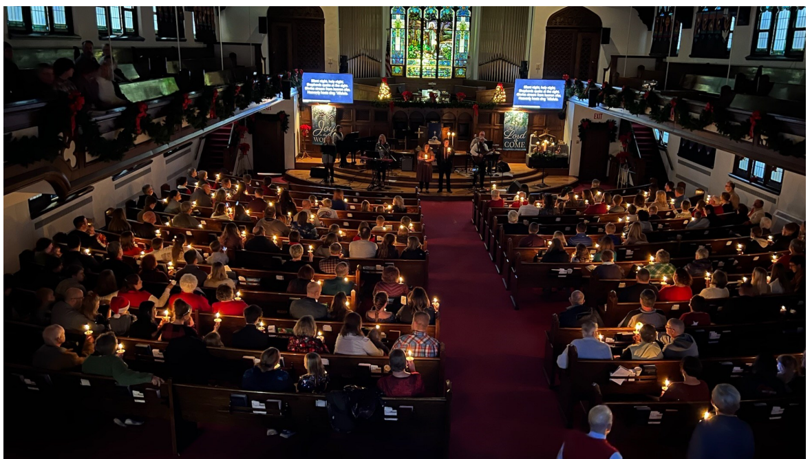
Candlelight during singing of "Silent Night"