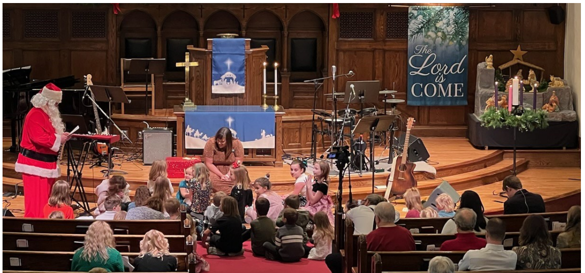
Santa stopped by to pray with the children during the "Time for Young Disciples"