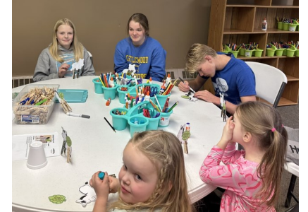
Bottom Right - Palm Sunday- donkey craft