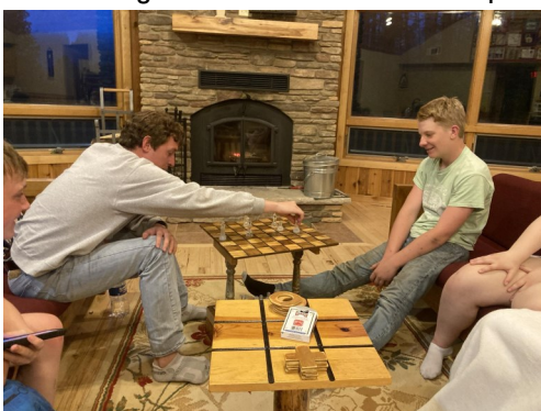
A Game of Chess at the End of a Busy Day