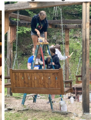
Staining Bench Swings page 7