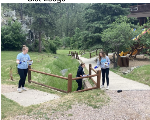
Staining the Rail Fence at the Camp