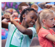
Sing & Play Splash