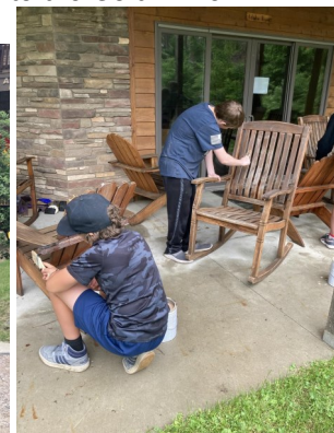
Staining Rocking Chairs