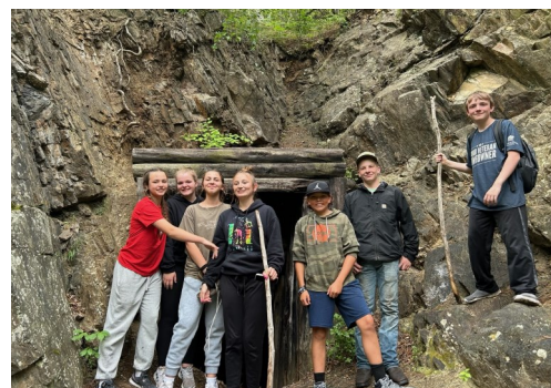
A hike to the Gold Mine