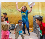
Deep Bible Adventures