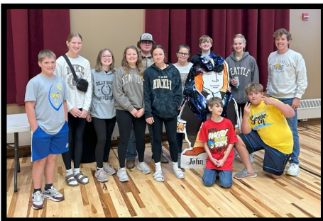
First Church group at Dak Youth

During youth group, our discussions have been around exploring what our purpose is. Confirmands have covered who Jesus is, what the Bible is, and how the Holy Spirit is at work in our world.