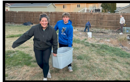
Confirmation Beacon Center Serve Night