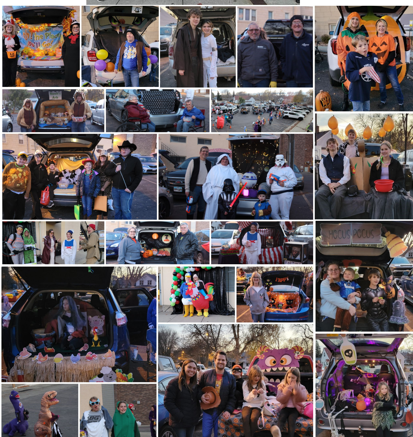
CONNECT | GROW | SERVE

WE ESTIMATE CLOSE TO 200 CHILDREN RECEIVED TREATS.