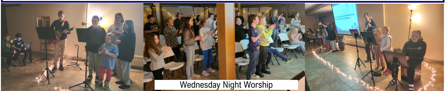
Wednesday Night Worship