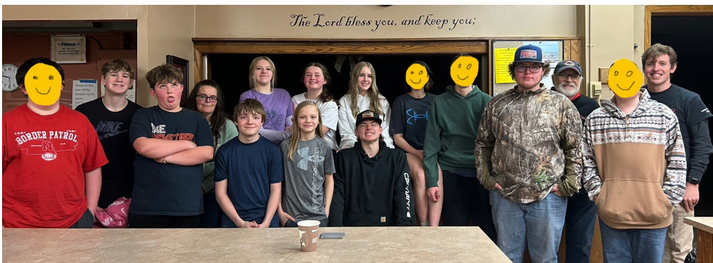
LEFT: Our Saturday Night Social group after a night of playing games!

At the end of the month, our confirmands attended Confirmation Camp at Lake Poinsett along with 85+ other students! The weekend consisted of worship, games, fellowship, and a rotation of classes covering Creeds/Affirmations of Faith, Grace, Communion, Baptism, and the Vows for Membership in The United Methodist Church.