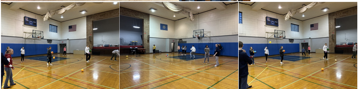
BELOW: Youth getting all their energy out with some dodgeball.