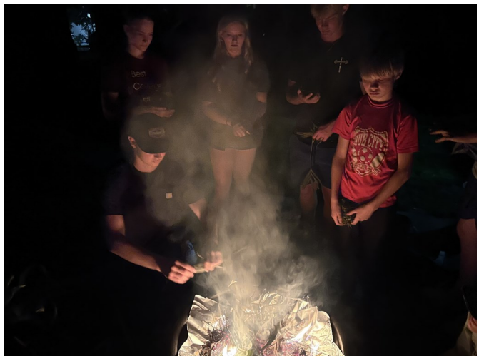
Youth burning the palm branches for Ash Wednesday.