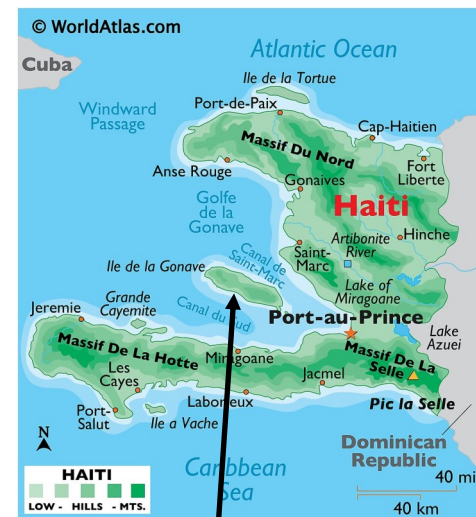
The Island of LaGonave